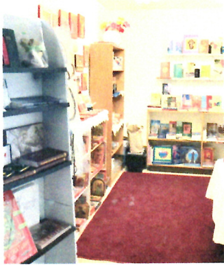
The St. Sophia has MOVED up into the Fellowship Hall