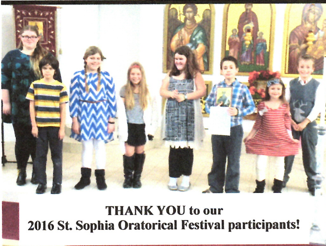
THANK YOU to our 2016 St. Sophia Oratorical Festival participants!