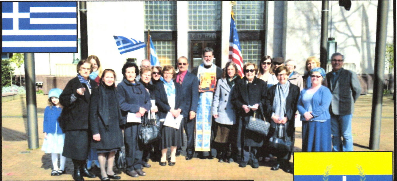
St. Sophia parishioners celebrate Greek Independence Day at the the entrance of Bellingham City Hall. March 25th, 2016.