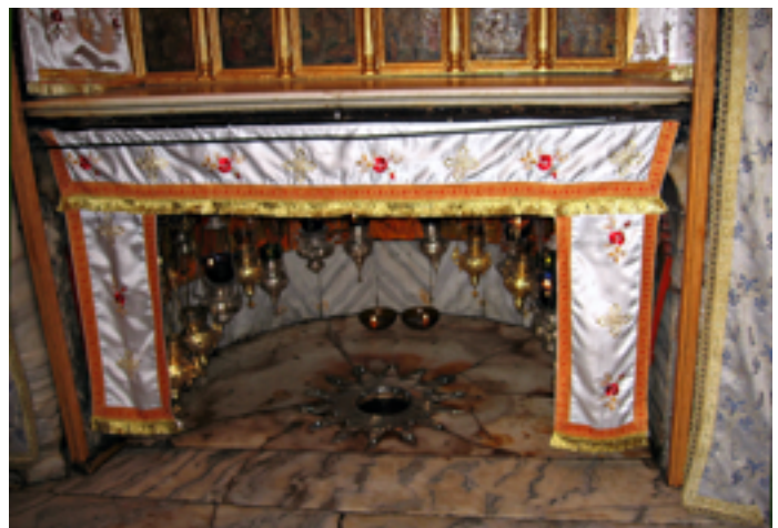
The Church of the Nativity, Bethlehem. The silver star marks the spot where Jesus was born.

To Him, then, Who out of confusion has wrought a clear path, to Christ, to the Father, and to the Holy Spirit, we offer all praise, now and forever. Amen.